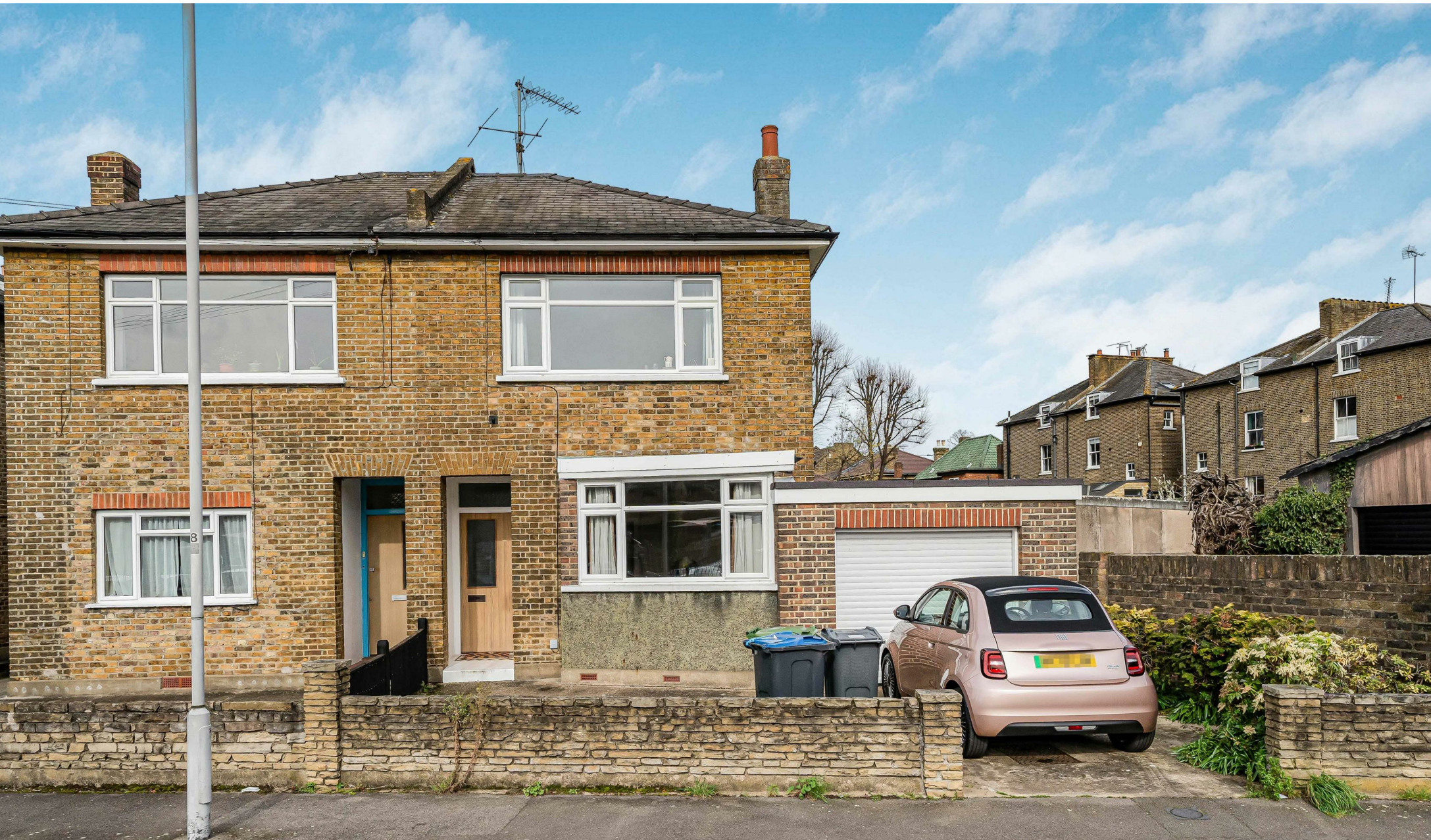
Grange Road Kingston upon Thames KT1 2QU

Approximate Gross Internal Area 1373 sq ft - 127 sq m (Excluding Garage) Approximate Gross Internal Area 1618 sq ft - 150 sq m (Including Garage) Lower Ground Floor Area 228 sq ft - 21 sq m Ground Floor Area 629 sq ft - 58 sq m First Floor Area 516 sq ft - 48 sq m Garage Area 245 sq ft - 23 sq m